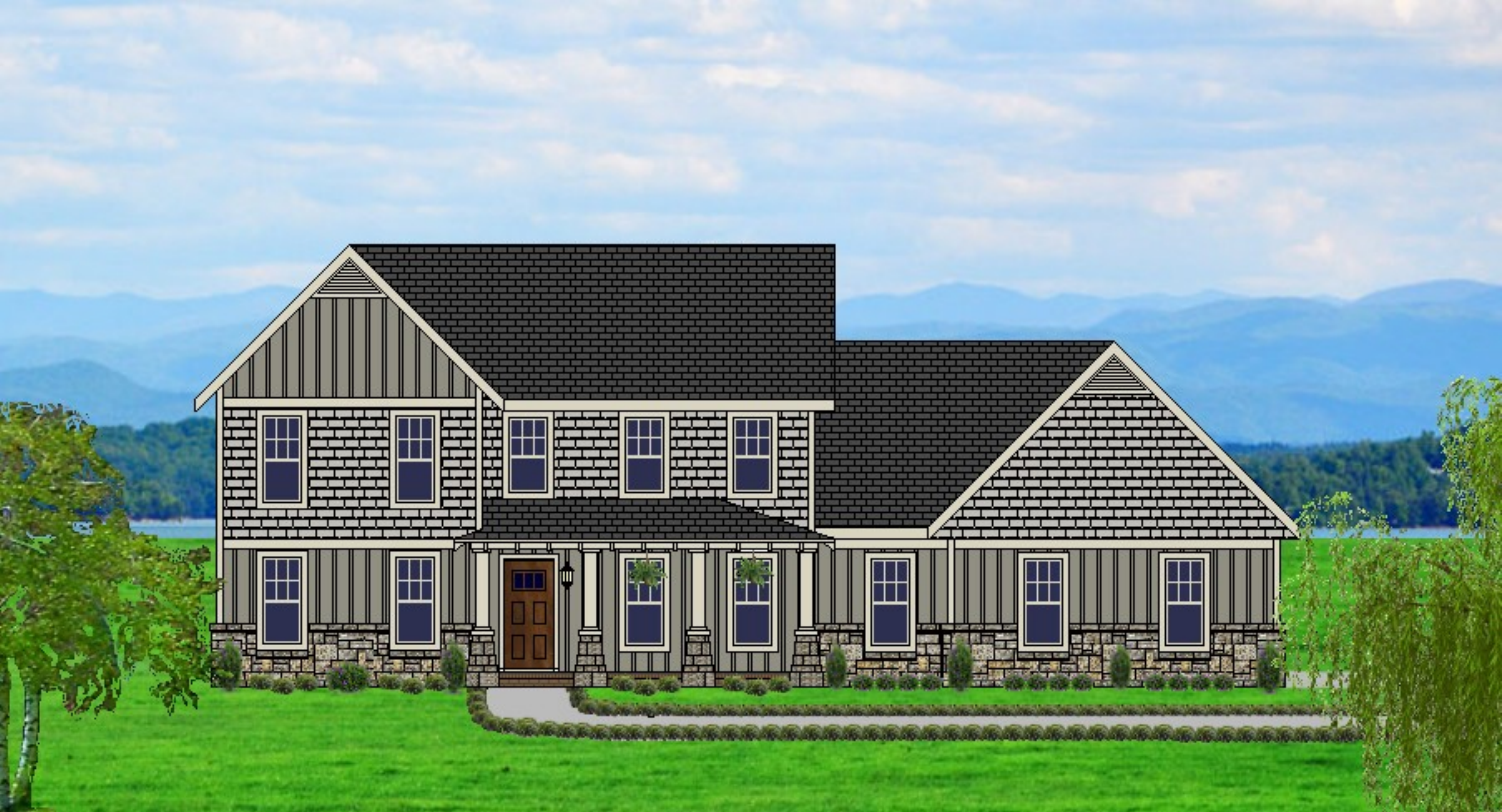
The Lincolntowne XVII with Double Garage Street Side View